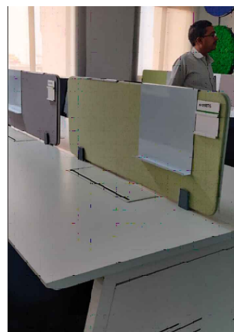
Pop up box coating match with table top