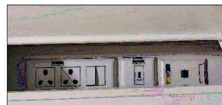
Reference Image for Pop up box